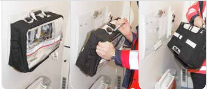
LIFE-BASE can be removed quickly and easily from the crash-proof BASE-STATION wall mount