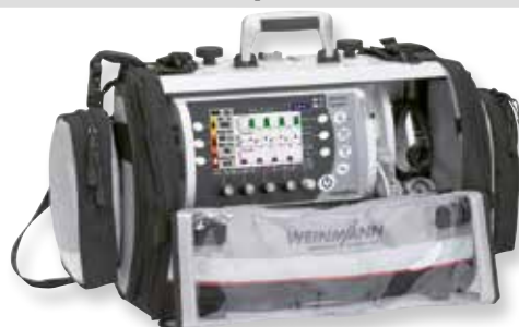
LIFE-BASE 4 NG with MEDUMAT Transport