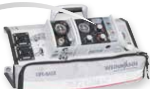
LIFE-BASE Mini II with MODUL CPAP and MEDUMAT Standard a