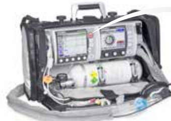
LIFE-BASE 3 NG with MEDUCORE Standard and MEDUMAT Standard 2