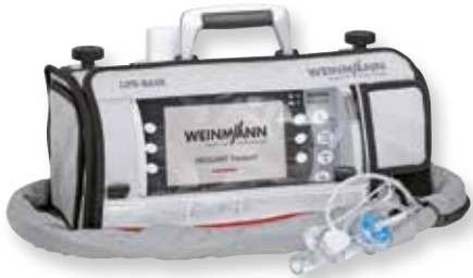
LIFE-BASE 1 NG with MEDUMAT Transport