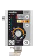
MEDUMAT Easy CPR