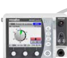
MEDUMAT Standard 2