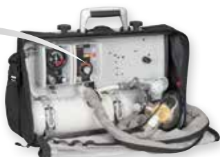
LIFE-BASE III with MODUL CPAP and MEDUMAT Easy CPR