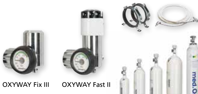
OXYWAY Fix III