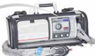
LIFE-BASE 1 NG XL with MEDUMAT Standard 2