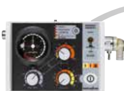
MEDUMAT Standard a